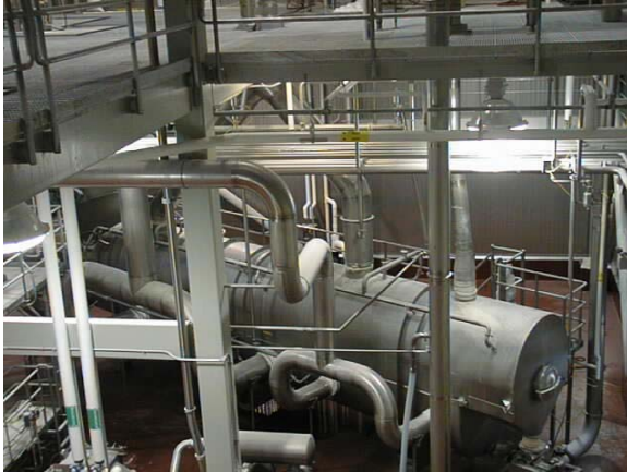
EDT Vibrating Fluid Bed