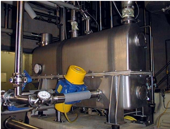
Pilot Size Vibrating Fluid Bed

Evaporator Dryer Technologies provides Vibrating Fluid Beds/Coolers engineered with new technological advancements to achieve the best processing results.