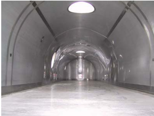
Directional Air Disperser Screen